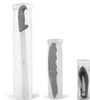
Figure A – knife tubes

Where possible use gloves that are slash proof to handle weapons. In all cases be aware of the blade especially in spring loaded and butterfly knives as they can cut fingers when opening, especially if you are unfamiliar with the mechanics.